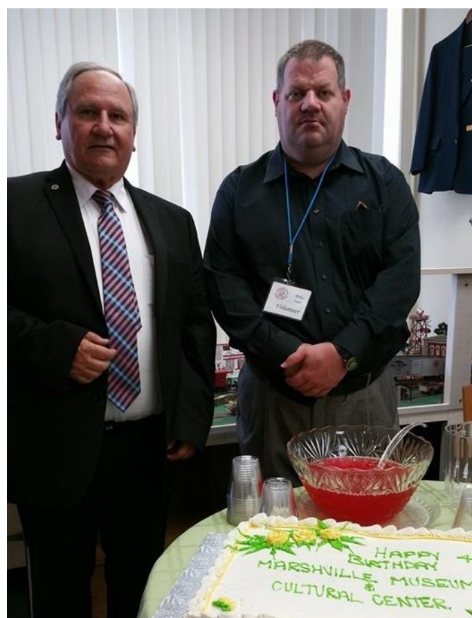
Marshville Museum /Cultural Center 4 th Birthday Celebration