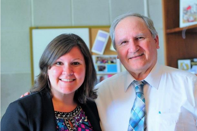
Legislative Short Session 2016- Office Picture